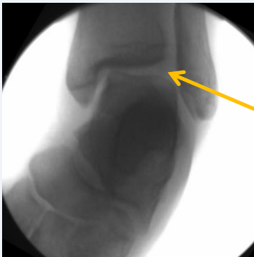
On the left: Pre-op stress x-ray image with talar tilt of about 15 degrees.