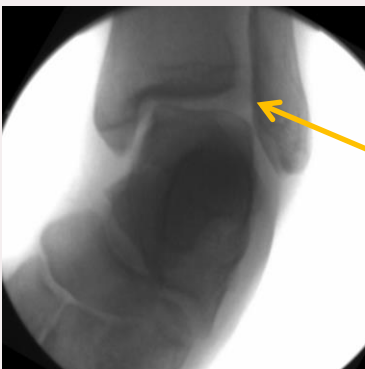
On the left: Pre-op stress x-ray image with talar tilt of about 15 degrees.